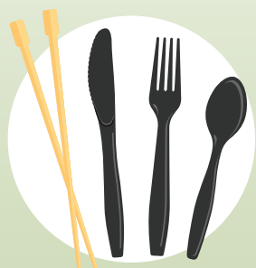
Knives, forks, spoons, chopsticks