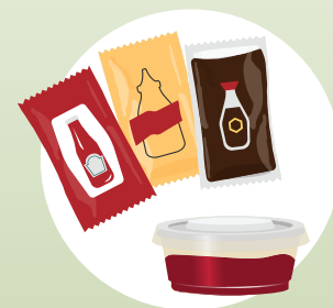
Sauce or condiment packets, sachets, or containers

To request an ADA accommodation, contact Ecology by phone at (360) 742-9874 or email at bagban@ecy.wa.gov , or visit https://ecology.wa.gov/accessibility .